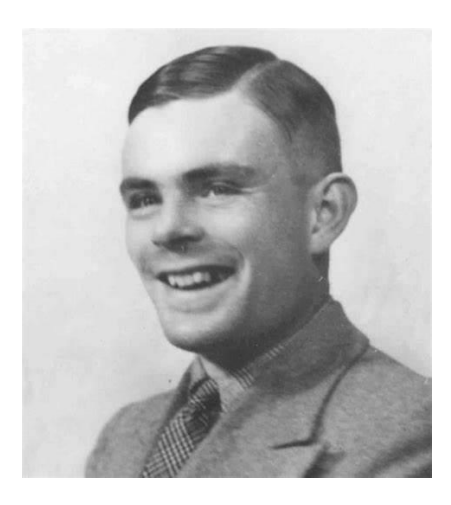
Bird Houses: Zaha Hadid – architect

<u>https://youtu.be/FwOqd5Rf0tc</u> <u>https://youtu.be/7zosfa2GQ1A</u> Starfish shaped airport in Beijing