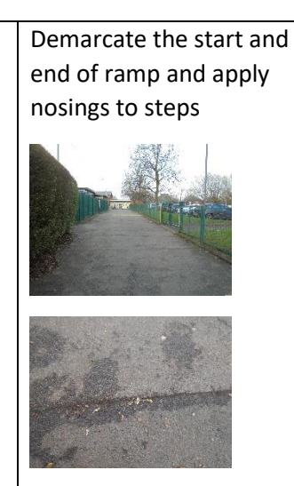
Highlight any uneven surfaces to warn users of potential trip hazard